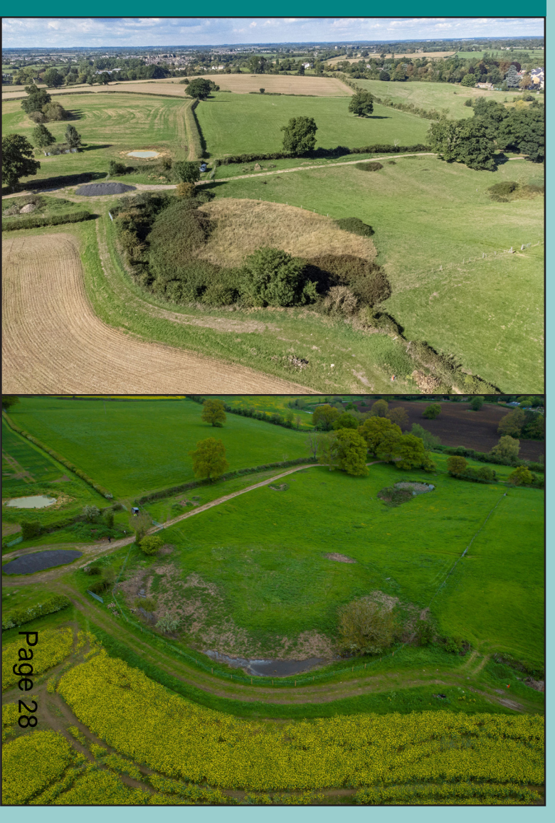
TOP: Cam's Hill ringwork before clearance looking towards Malmesbury. © Aerial-Cam. Reproduced with kind permission.

BOTTOM: Cam's Hill ringwork after clearance. © Aerial-Cam. Reproduced with kind permission.