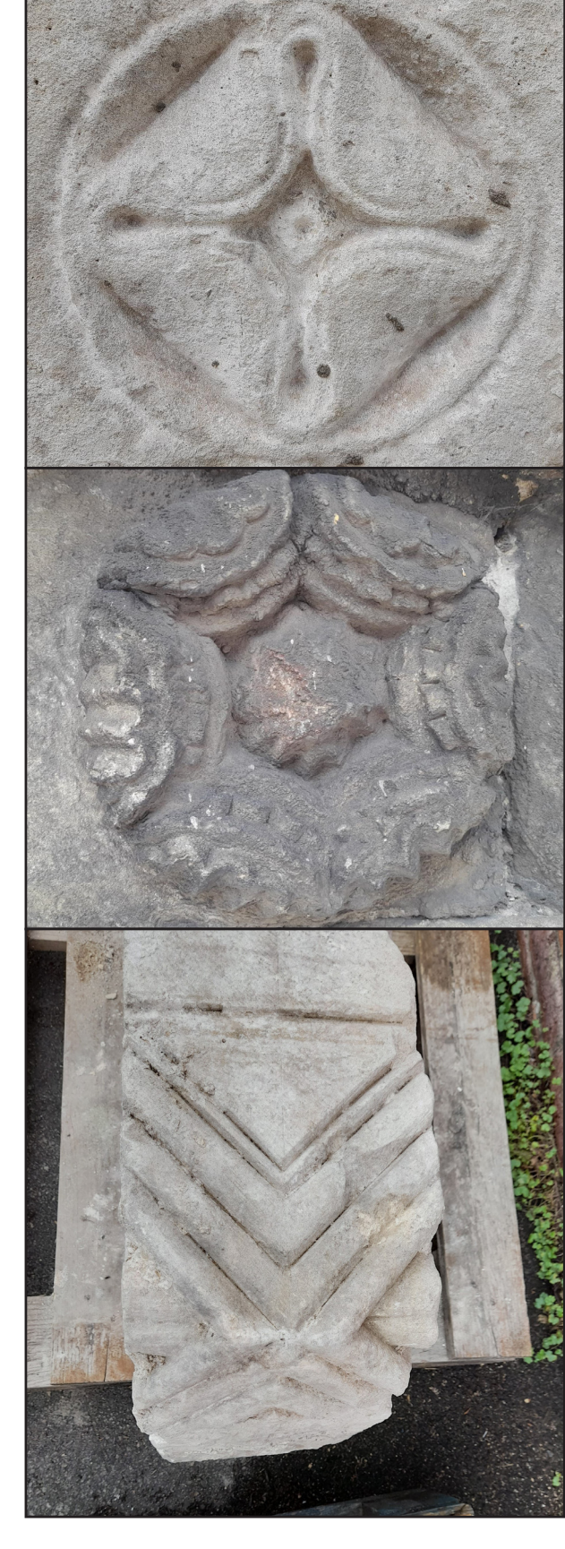
TOP LEFT: Salisbury Cathedral Close Wall under repair.

The exercise proved to be worthwhile as several pieces of very fine carved masonry were identified, mostly hidden and not visible on the face of the Wall. It also seems likely that even plain ashlar blocks came from the old Cathedral at Old Sarum. It seems odd today that, despite all the effort put into constructing a fine cathedral at Old Sarum, within a hundred years or so it was used as little more than a quarry for the construction of the Close Wall. However, it does add to the historical and archaeological importance of the Close Wall, which is also a strong architectural and aesthetic feature of the Close and the city landscape.