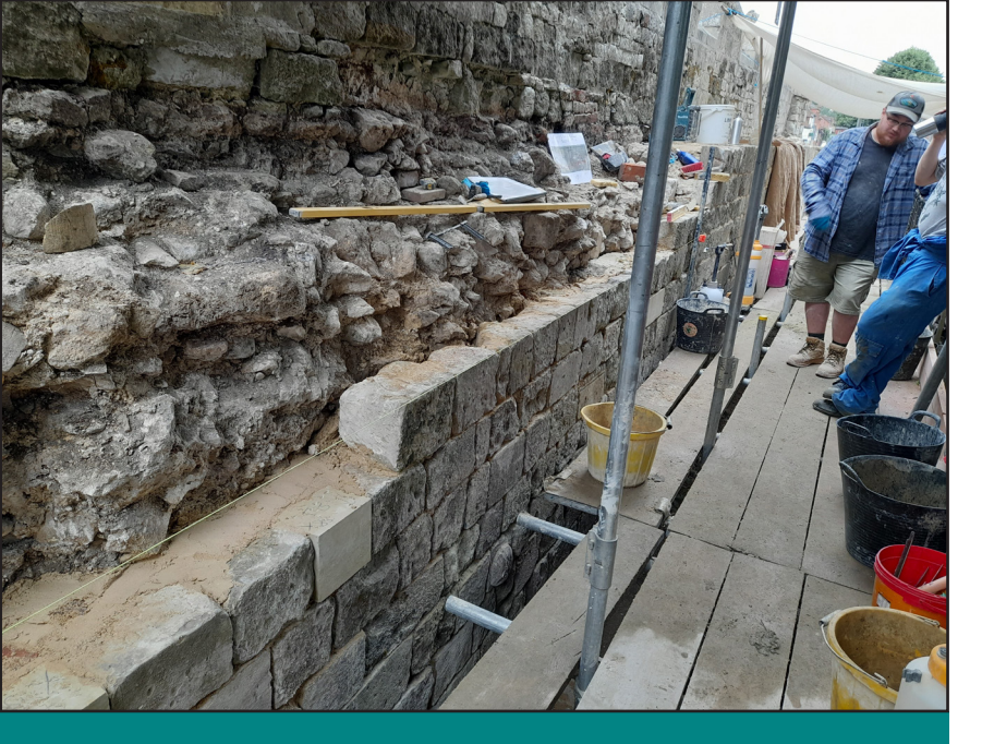
THE REMAINS OF OLD SARUM'S CATHEDRAL FOUND IN NEW SARUM'S CATHEDRAL CLOSE WALL

The Grade I Cathedral Close Wall in Salisbury started to be constructed in the later 13th-century but was not completed until the 15th- or 16th-century. It was built both as a defensive structure but also as a symbol of the status of the clergy and their lordship of the Close. It is known that permission was given in the 14th-century for stone from the Cathedral at Old Sarum to be used in the construction of the Close Wall and carved stone from the Cathedral can be seen on the Exeter Street face of the Close Wall in the form of stylised flowerheads.